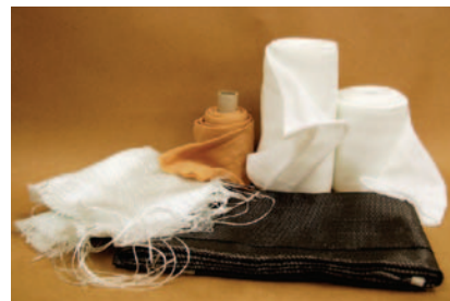
Reinforcing fabrics for O&P laminations

Whatever the needs and desires of our patients, we are prepared to fabricate the most appropriate materials into each device we create.