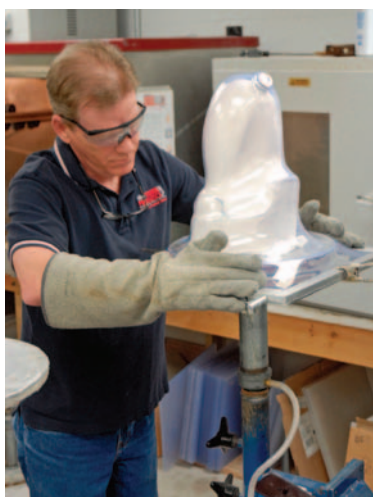
Forming the check socket.