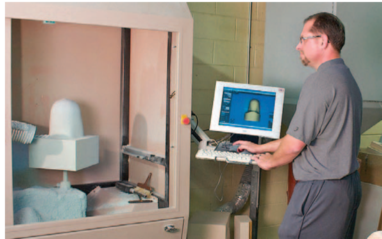
CAD/CAM system creates positive limb mold digitally.