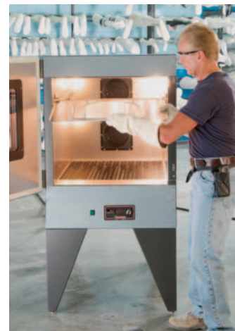
Heating thermoplastic prior to shaping over positive mold.