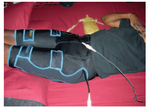
Wearable therapy electrode garment

BioCollar: Illustration of a purple BioCollar garment.