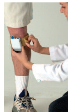
WalkAide® FES system for addressing foot drop

Articles on pages 2 and 3 discuss three products producing excellent results in the management of foot drop and a unique approach to securely surface electrodes on almost any part of the body. We welcome you inquiries and referrals.