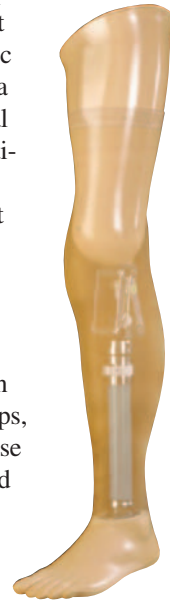
Prosthesis for knee disarticulation

• No bones or muscles are cut in the surgery, so strength, muscle tone and balance are typically good. The intact femur provides a long mechanical lever powered by strong muscles for effective ambulation, better sitting balance and leverage.