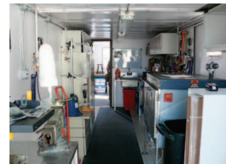
O&P lab built into a shipping container is now serving earthquake victims in Haiti.

To help the earthquake amputees of Haiti, visit the websites of Healing Hands for Haiti, www.healinghandsforhaiti.org and/or Handicap International, www.handicap-international.us .