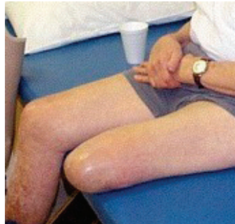
Knee disarticulation leaves a long residual limb.

• As compared with a transfemoral socket, which normally must extend up to the ischium for weight-bearing, the proximal end of a knee disarticulation socket fits much lower on the femur and can be made of softer material, providing substantially more comfort both standing and sitting.