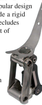
Polycentric knee for K.D. limb