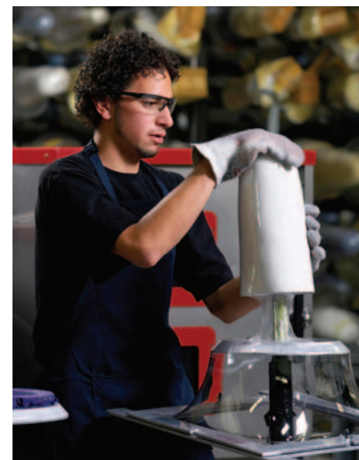
Vacuum forming a socket over mold of a residual limb.

Selecting the most appropriate componentry for a new amputee's specific needs and abilities is an essential part of the prosthetic process. After a careful preparatory phase, the definitive prosthesis is fabricated using more permanent materials and incorporating all knowledge gained to date.