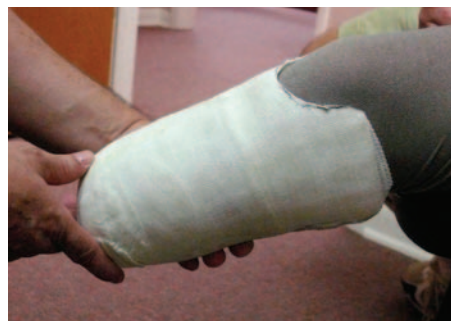
Fiberglass cast creates image of residual limb for fabricating prosthetic socket.

The preparatory prosthesis also helps the clinical team determine the amputee's ultimate ambulation potential and the most appropriate components for the permanent system.