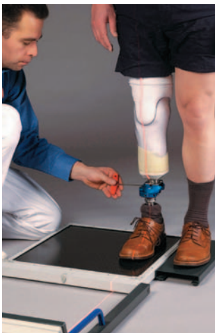
LASAR Posture alignment system.

“Fit” refers to the quality of the interface between the socket and residual limb. “Alignment” is the important relationship of the socket, ankle and foot in a below-knee prosthesis (adding the knee for an above-knee limb). Because a unilateral lower-limb amputee expends an estimated 40 percent more energy walking than a person without limb loss, it is essential that the limb function with optimal efficiency.