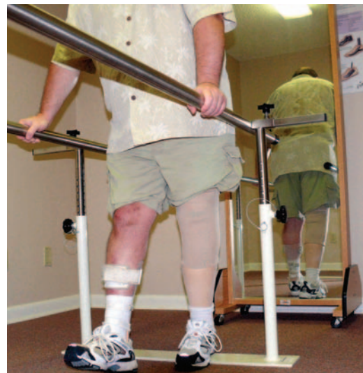
Gait training—Key ingredient for regaining ambulatory mobility.

Between these extremes the custom removable rigid dressing and prefabricated options such as the APOPPS (Adjustable Post-Operative Protective & Preparatory System) offer compromise solutions that enable both wound inspection and reasonably early weight-bearing. Even if not involved before the amputation, the prosthetist can still initiate early intervention if the referral is made while the patient is still in the hospital. The sooner the prosthetist and therapists working with the new amputee can coordinate their efforts, the better.