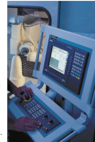
CAD/CAM carver brings digital precision to forming socket molds.

Starting with information from a direct scan or negative cast of the residual limb, CAD/CAM software presents a visual image of the limb from which the prosthetist can design a socket on a monitor, optimizing the overall shape and trimlines and adding build-ups and reliefs as necessary. Finally, the CAD/CAM system feeds the design to a carver, which that creates a positive model over which the shell of the definitive socket can be vacuum-formed.